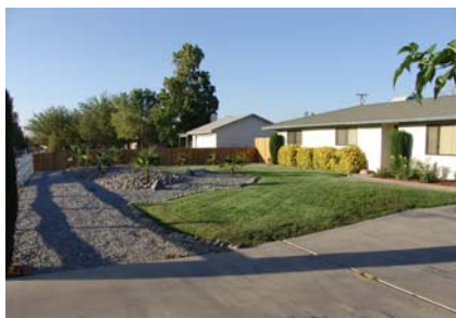
Before Cash for Grass

● Cash for Grass- Over one million square feet of turf has been removed by AVRWC customers and been replaced with water